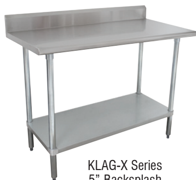
KLAG-X Series 5" Backsplash