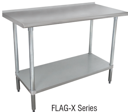
FLAG-X Series 1 1/2" Backsplash