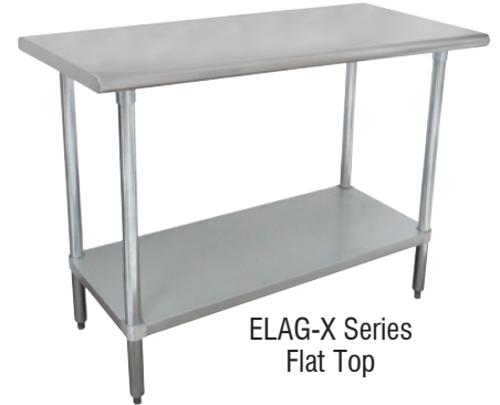
ELAG-X Series Flat Top